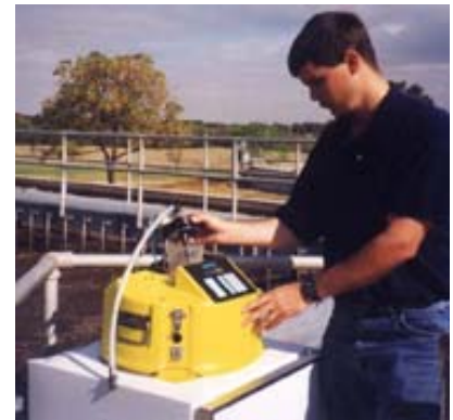
VSR Sampler Operation