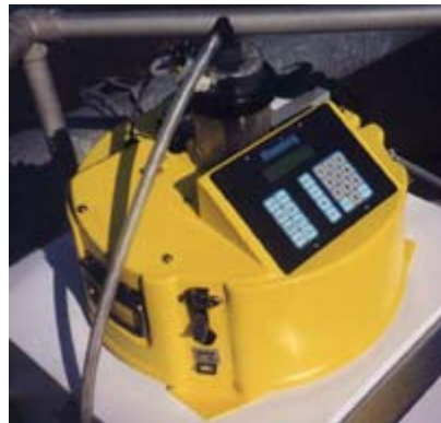
VSR Sampler Control Panel