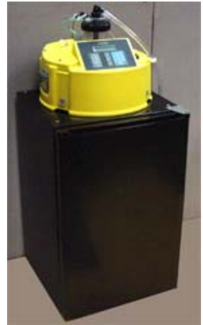
Manning Model VSR Sampler on an Economy Refrigerator