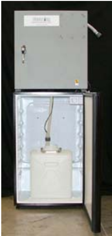
Manning Model S-5000 Sampler on an Economy Refrigerator

This refrigerator is offered as an economical alternative to Manning's standard 6.1 cubic foot (ft 3 ) refrigerator for single bottle applications in conditions where the sampler is protected from the elements, indoor, or in a shelter. The economy, however, is not only in the price of the unit, but also in the energy saved. Under normal use, this unit should only consume an estimated 316 kWh per year for an estimated yearly operating cost of about $14.78!* When compared with similar models rated at between 383–436 kWh per year, the savings is clear. The selection of this refrigerator ensures you will save money at the time of purchase and will continue to save money over the life of the unit due to the energy-saving design. Intended for sheltered, indoor,